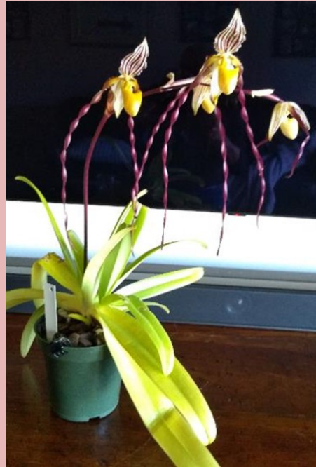
Paphiopedilum philippinense Serge Croteau