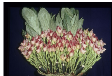
Anguloa × costae 'Marsh Hollow' CCE/AOS. 2003, Toronto.