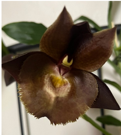
Catasetum John Burchett 'Ursa Major' FCC/AOS x Catasetum Millie's Frilly Dragon 'Chocolate Frills'