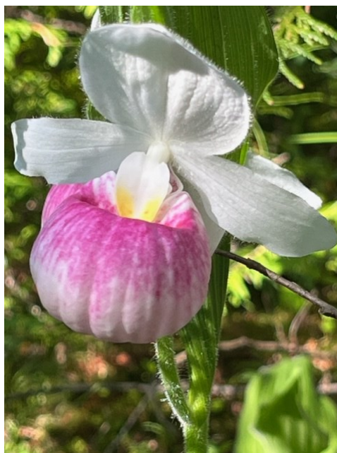
Cypripedium reginae