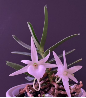
Angraecum didieri

Seems like yesterday that I wrote the 'Editor's Wrap' for the November issue of Spike. It has been a very busy month and we are really looking forward to some downtime over the Holidays.