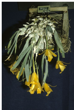
Prosthechea citrina 'Helma' CCM/AOS. 1986, Ottawa.