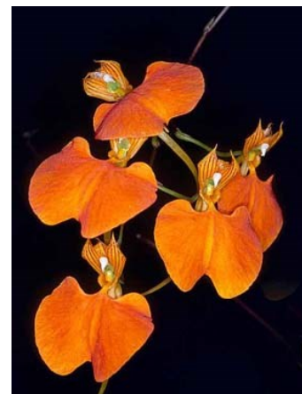
Comparettia speciosa 'Jardin botanique de Montréal' AM/AOS.