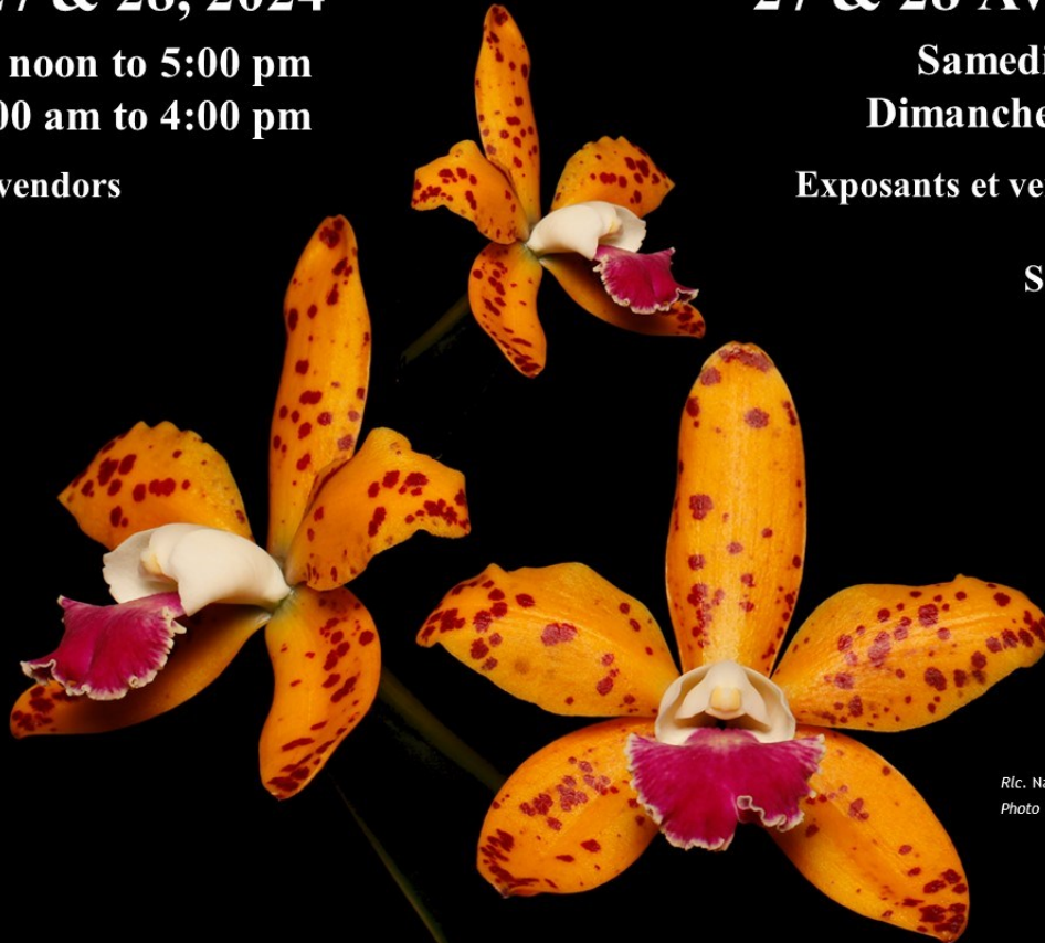
R/c. Naomi's Delight

PHOTOGRAPHERS: TRIPODS WELCOME SUNDAY 9-11 AM