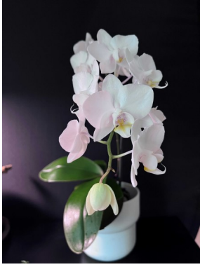
Phalaenopsis unknown hybrid

The ODG meetings were a great success over the last season and will continue with monthly meetings on Zoom (preregistration is required). Our next meeting is scheduled for Thursday, April 11, 2024 , at 7:00 p.m.