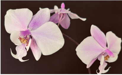
Phalaenopsis schilleriana

Winter season in Ottawa this year is not what we're typically used to. Its the beginning March, there is very little snow on the ground and I love it! Spring is in the air and as I am writing this, I can hear the beautiful song of the robins outside. Another, albeit not a welcome sign of spring is that we are also setting our clocks ahead on Saturday night (sigh again), extending daylight in the evenings.