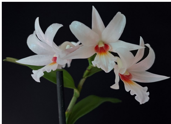
Dendrobium draconis