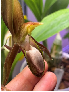
Catasetum tabulare

Well it's almost a wrap for Summer 2023. I never thought I would say this, but after what feels like 40°C temperatures this week, I am very much looking forward to some cooler fall weather. We have begun the harvest in our vegetable gardens and are very grateful to have tomatoes, peppers and other vegetables in abundance. I am looking forward to filling the freezer, which is great given the price of groceries. Growing our own food is so rewarding. Well almost as rewarding as growing and blooming orchids.